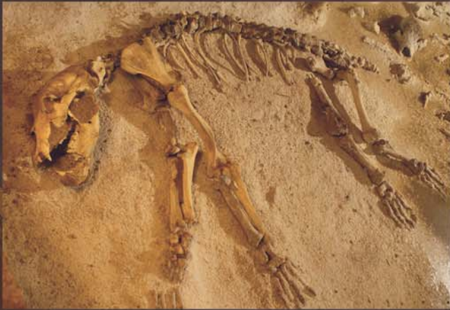
Generations of cave bears inhabited the prehistoric cave for over 300 000 years.