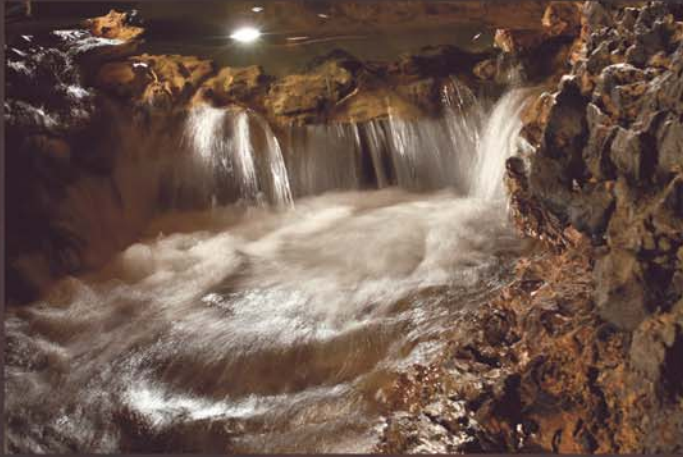
Waterfall on the underground river

The underground river tirelessly sculpts the rock to offer you scenes of pure magic.