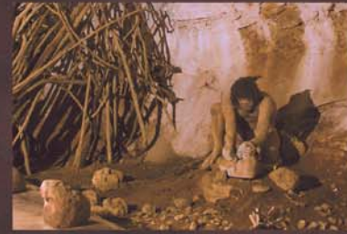
A habitat for Homo erectus

Since lower Palaeolithic times (about 350,000 years ago), the prehistoric cave has often served as a refuge for humans.