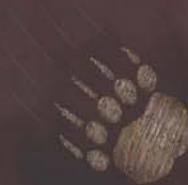
200 year-old classified cedar trees

Today, the cave is home to several species of small land mammals and cave-dwelling water creatures