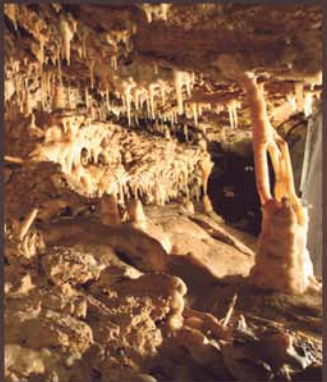
Stalactites and stalagmites