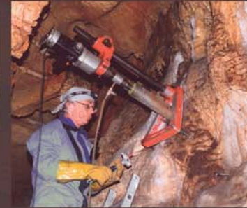
Taking core samples for dating

Speleologists and scientists continue their exploration of the cave with the same passion and the same thirst for understanding our history and our natural environment.