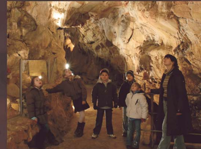
A school visit