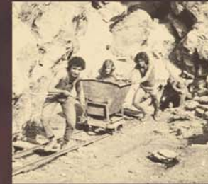
Clearing the galleries

Since 1963, enthusiasts have been devoting themselves unreservedly to uncovering the underground network. They have revealed traces of activity of both mankind and prehistoric animals and exhibit them for the public to wonder at.